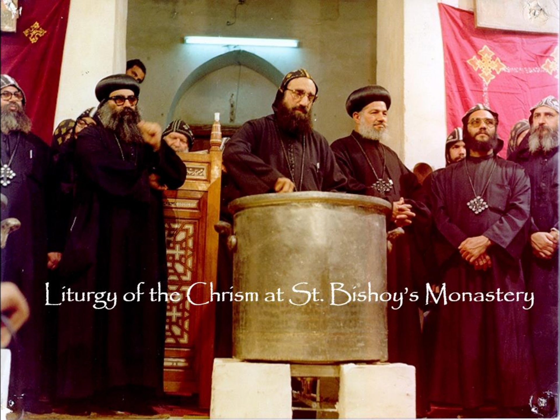
Liturgy of the Chrism at St. Bishoy's Monastery