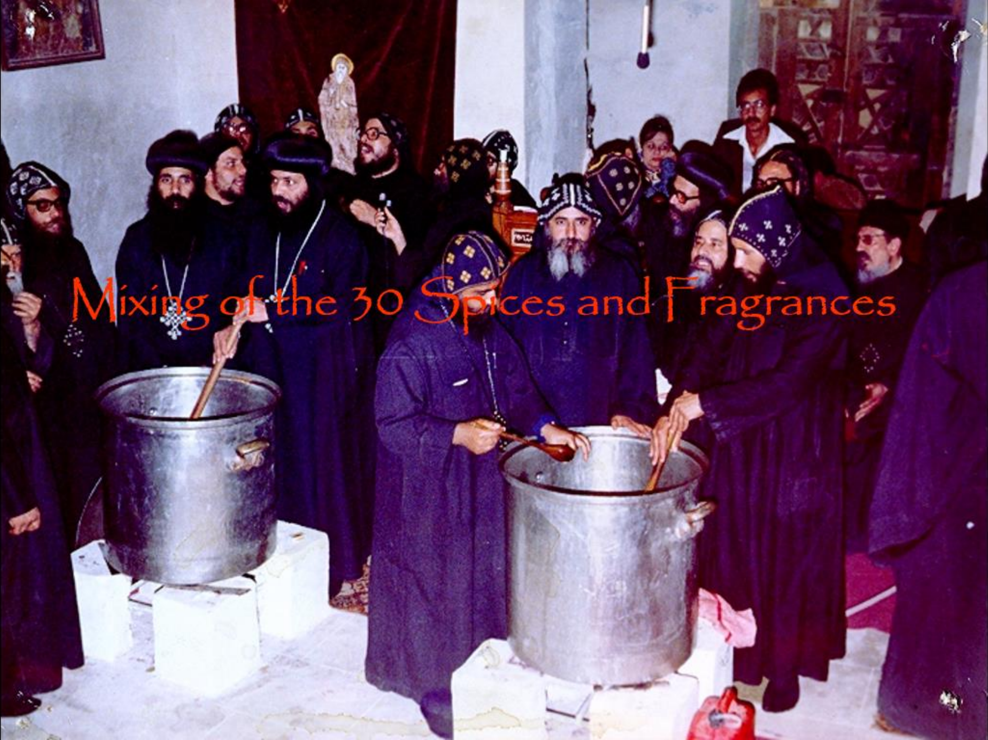
Mixing of the 30 Spices and Fragrances